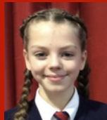
Deputy Head Girl