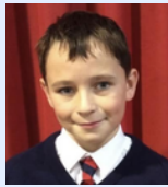
Deputy Head Boy